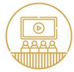
OPEN AIR THEATER